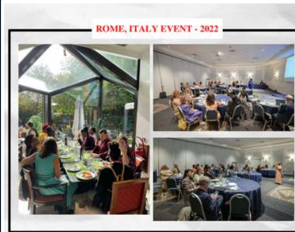
ROME, ITALY EVENT - 2022