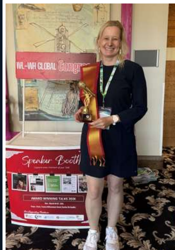
MARCH 04-07, 2026 - PARIS, FRANCE