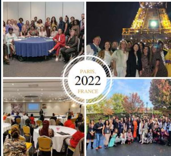
PARIS 2022 FRANCE